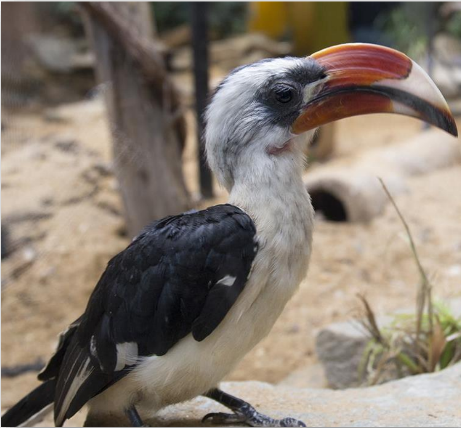
Von der Decken's Hornbill