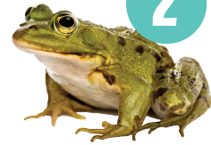
2 Frog Amphibian