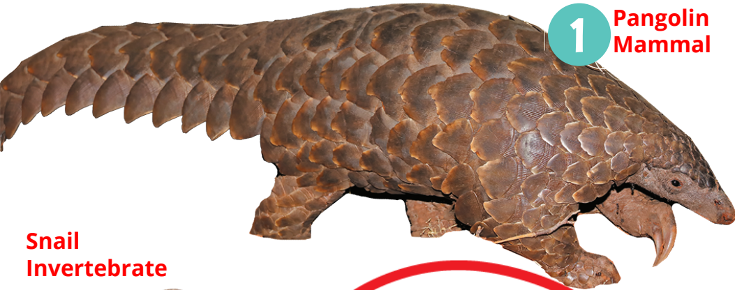
1 Pangolin Mammal

The animals below asked, "Am I a reptile?" We need your help! Circle all the reptiles below.